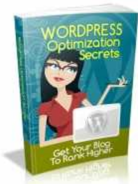
WordPress Optimization Secrets

This powerful tool will provide you with everything you need to know to be a success and achieve your goal of getting top ranking for your WordPress site.