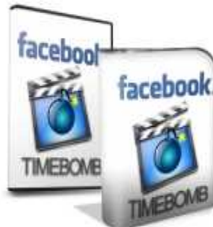
Facebook Video Timebomb

With this product, and it's great information on ramping up your page rank it will walk you, step by step, through the exact process we developed to help people put an end to lack of their WordPress performing the way that it should.