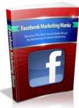
Facebook Marketing Mania

With this product, you'll tap into the basics of using Facebook to market your business effectively.